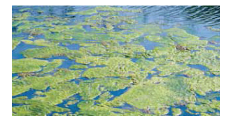
the environment, the half-life of MC-LR is approximately 10 weeks. Figure 1: Blue/green algae bloom

Microcystins are a group of naturally occurring toxins produced by various genera of cyanobacteria, including Microcystis, Anabaena, and Oscillatoria (Planktothrix). Cyanobacteria, commonly referred to as blue-green algae, are photosynthetic prokaryotes that occur naturally in surface waters. Nutrient rich, eutrophic, warm and low turbulent conditions in freshwater bodies typically promote the dominance of cyanobacteria within phytoplankton communities. Excessive proliferation of cyanobacteria leads to blooms that disrupt ecosystems, adversely affect the taste and odour of water, and increase water treatment costs (Figure 1). When a cyanobacterium dies, its cell wall degrades and the toxins are released in the water. Microcystins are extremely stable in water and withstand chemical breakdown such as hydrolysis or oxidation. At typical conditions in